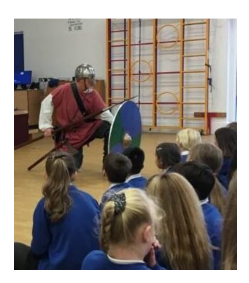
I am an historian...

I am an historian. I study the story of humankind. As an historian, I understand chronology and understand that different societies of people lived in places of the world at different and whilst other societies of people lived in other places of the world. I seek to understand who lived when and know more about their lives and the impact they had on others, locally, nationally and globally. I will ask questions and investigate my own lines of enquiry. I will explore artefacts and use evidence to learn about the past. As a historian, I consider and challenge viewpoints and share my perspective.